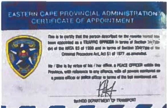
Back of Appointment Card